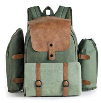
* * * TRAVELLING BAGS SERIERS * * *